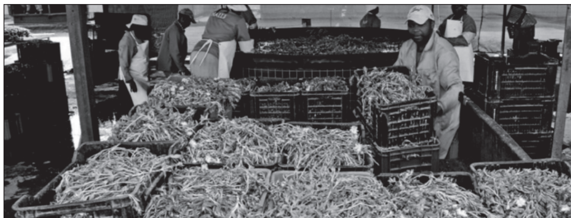
Cultivated Sceletium for the production of the standardized extract Zembrin®.