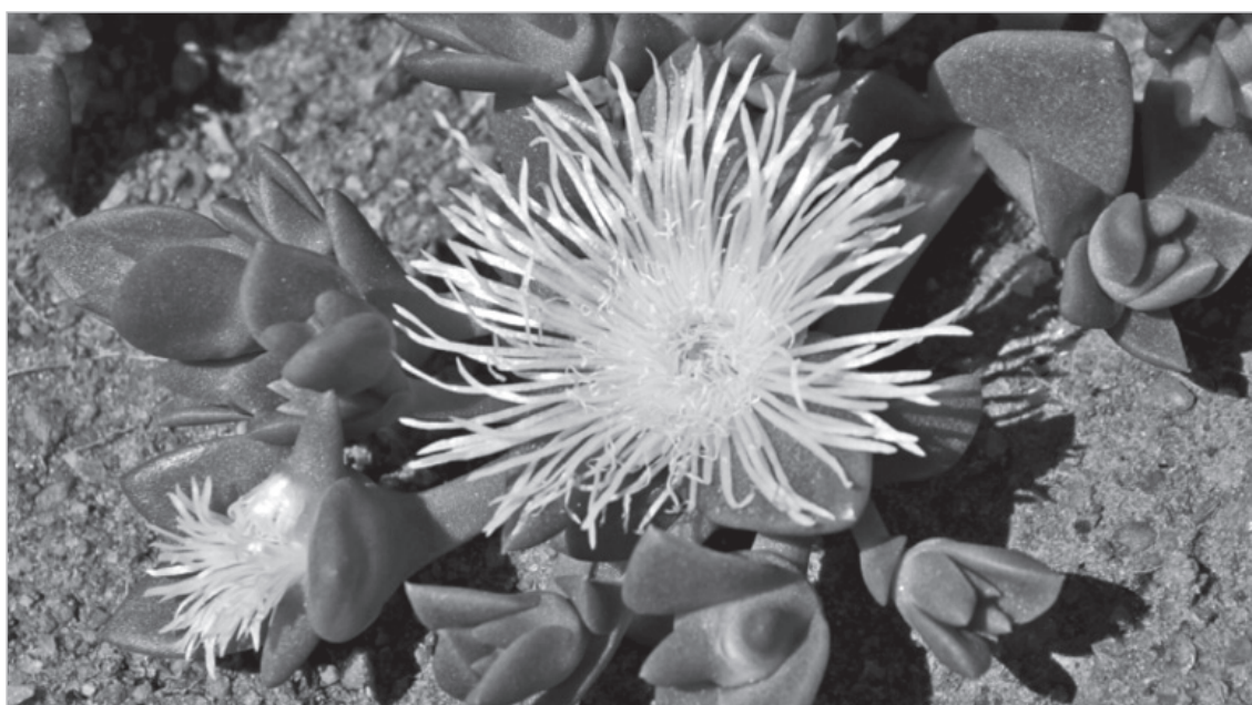
Flower of a low-mesembrine Scelletium cultivar.